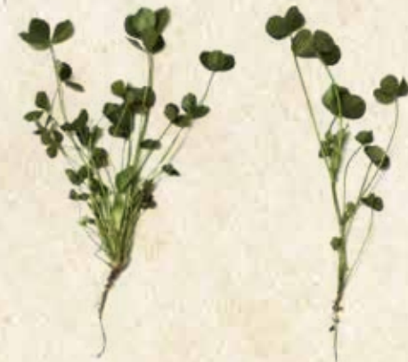
FIXATION BALANSA CLOVER ENDURO BALANSA CLOVER